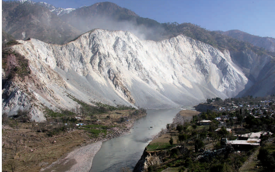
The October 2005 earthquake in Pakistan, which caused this landslide at Muzaffarabad, continues to present recovery challenges.