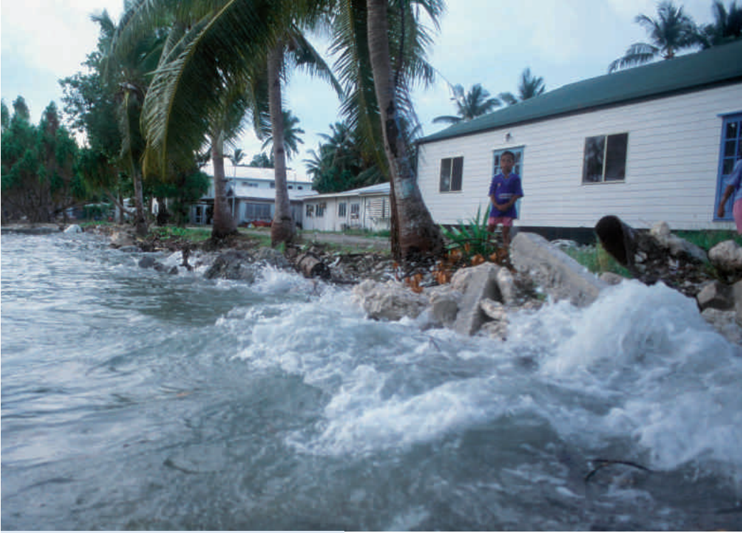
Waves from the atoll lagoon threaten buildings in Tuvalu, Funafuti, during exceptionally high tides in February 2002.

Environmental degradation, settlement patterns, livelihood choices and behaviour can all contribute to increase disaster risk, which in turn adversely affects human development and contributes to further environmental degradation. The poorest are the most vulnerable to disasters because they are often pushed to settle on the most marginal lands and have least access to prevention, preparedness and early warning. In addition, the poorest are the least resilient in recovering from disasters because they lack support networks, insurance and alternative livelihood options.