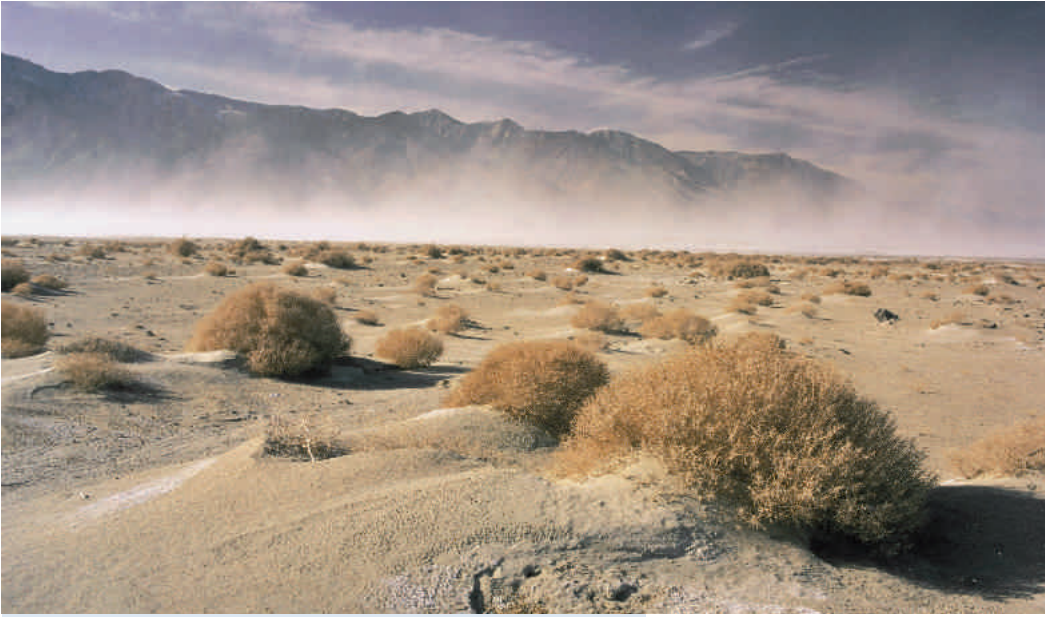
View of a desert storm. Land degradation, including desertification, forces communities onto marginal lands and increases their vulnerability to disasters.