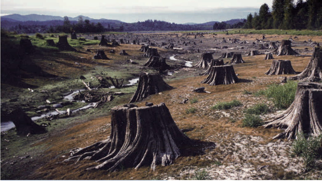
Loss of biodiversity leads to a decrease in ecosystem productivity, biological resources, ecosystem services and social benefits.

elaborated by the disaster reduction community also provides a valuable framework for analyzing patterns of vulnerability to environmental change and identifying opportunities for reducing that vulnerability.