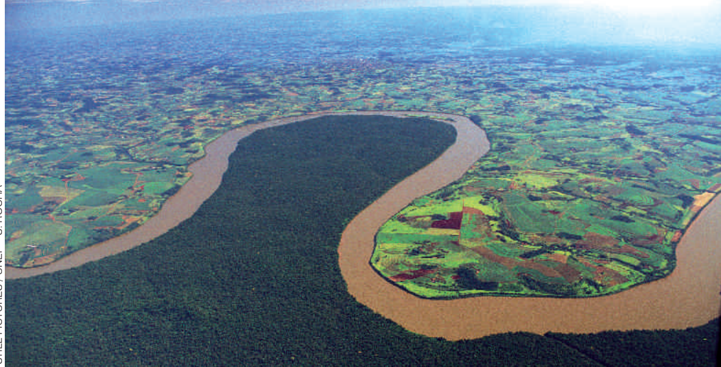
A bend in the Iguacu River shows the contrast between dense forest and agricultural expansion. The undisturbed forest on the near bank is part of the Iguacu National Park.