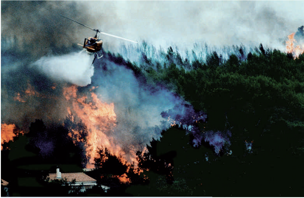
Fire fighters protect neighbouring communities in their response to a forest fire in France.

The integration of industry emergency plans with local emergency response plans into one overall community plan to handle all types of emergencies is the basis of a multi-hazard multi-stakeholder approach to emergency preparedness. In this respect, it is of the utmost importance to promote the involvement of all members of the community in the development, testing and implementation of the overall emergency response plan, promoting awareness of the underlying risks, and plan ownership.