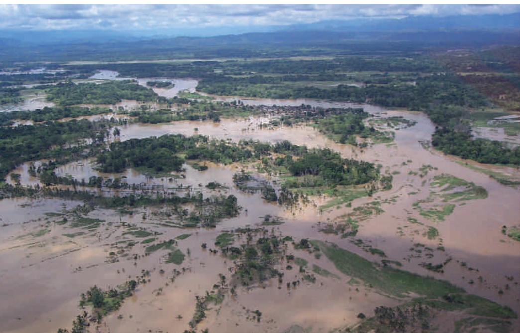
Flooding in the Sambava District of Madagascar. The 2006-2007 cyclone season in Madagascar has been particularly severe, affecting around one million people.

resilience against drought in arid and semi-arid zones. In the US, the Coastal America Initiative illustrates how government, private sector and other partners can join together to support broad-ranging wetland management efforts.