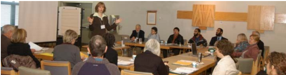
Gender and Disaster in Canada: New Thinking, New Directions, Cape Breton University, 2006

The face of emergency management is changing. As should be expected, male emergency managers today—young and old, short-termers and lifers—are adjusting differently to the new mix. For women, as you may have experienced or observed, the challenges are intensely personal. Both women and men are agents of change in this era of transition and challenge, and our communities are safer for it.