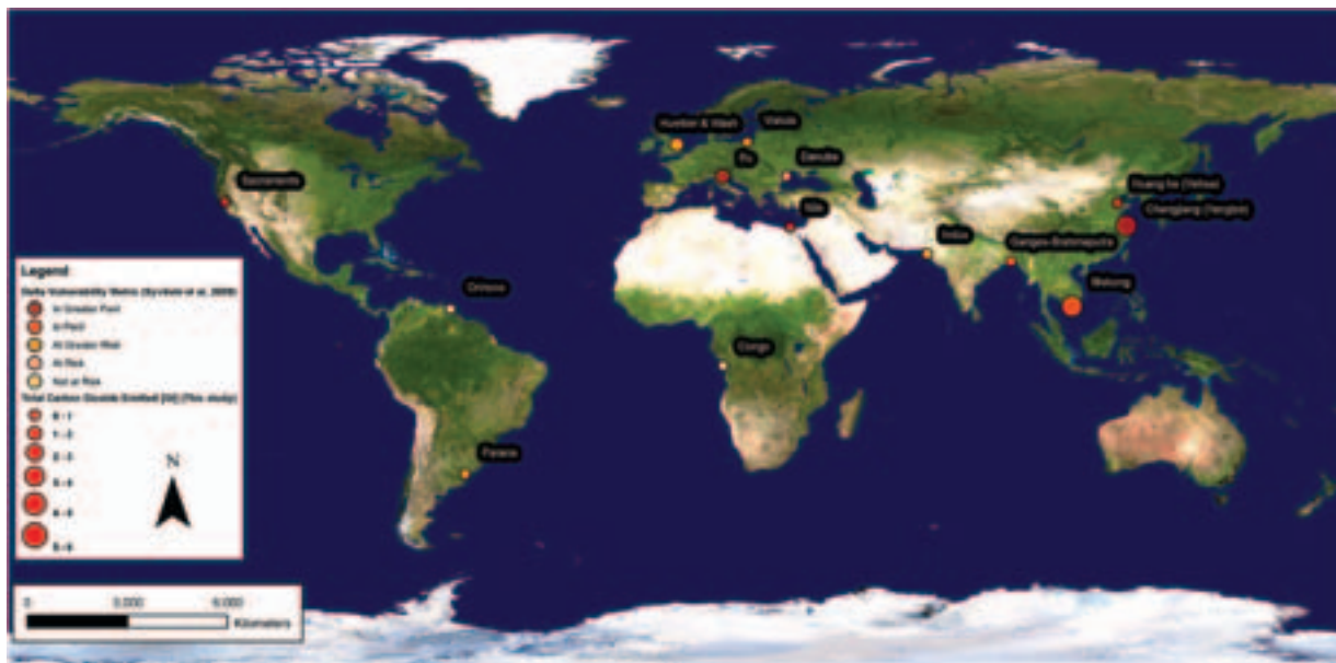
Figure 1. Estimated CO 2 Emissions from Drainage of Wetland Soils in Thirteen Large Deltas

This dataset is a small but representative case study subset of global coastal systems, including both temperate and tropical deltas. Almost all coastal systems are subject to wetland conversion and drainage, releasing CO 2 . Included with the emissions estimates is a description of delta vulnerability to potential flooding associated with present day sea level rise and reduced sediment supply from rivers (derived from Syvitiski et al., 2009). Technical description of analysis is provided in Annex 2.