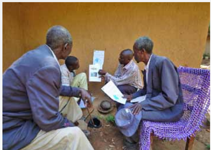
SCF meets IKF: Members of the Nganyi "rainmaker" clan of western Kenya working with meteorologists to develop a harmonized forecast that bridges between their systems of interpretation.

A key outcome expected of the project is increased use of climate information by the community in planning their activities, along with increased mutual trust and information exchange between climate scientists and those with indigenous knowledge. In addition, the project will be able to document the history and practices of the Nganyi community and outline the structure of a sustainable disaster risk management curriculum incorporating indigenous knowledge. In July 2010, KMD committed resources to build a new community resource centre which will help to sustain indigenous forecasting practices, and strengthen the harmonization between SCF and IKF begun in this project.