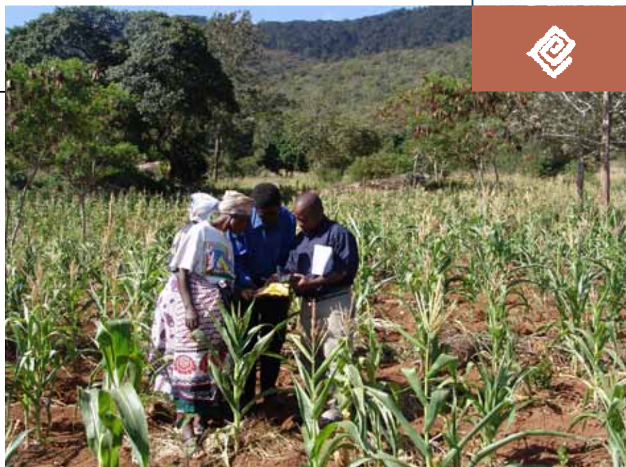
Farmers and researchers discussing drought tolerant maize varieties near Vumari village of Tanzania's Same district.

In Same District, Tanzania, the Managing Risk in the GHA (SUA) project has established a core team that includes staff from the meteorological