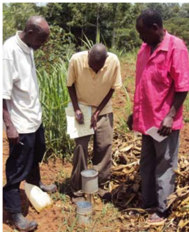
Farmers learn conventional methods of measuring and recording rainfall

Farmers used the exogenous knowledge of climate variability to assess the capability of seasonal forecasts to capture local-level climate variability. Next, for 3 years starting with the short rains of 2007, a team of farmers, extension agents, agricultural researchers and the meteorological service together developed downscaled (locally adapted) climate forecasts from the seasonal climate forecasts issued by KMD. Inputs from local leaders, farmers and extension agents were used in the downscaling process. These inputs included consideration of farmers' own indicators for climate forecasting and determination of how local topographical features differentiate rainfall and thus shape local climate variability. This helped to correct the forecasts and thus enhance their local accuracy. The downscaling process is summarized in Box 1.