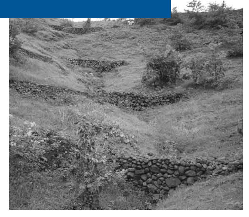
■ Identify prevailing forces and conditions that serve as barriers to action or enabling factors in the implementation of new policy measures.