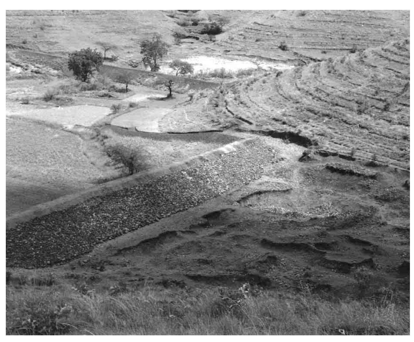
Nala Bund, Chincholi village, India (October 1997).