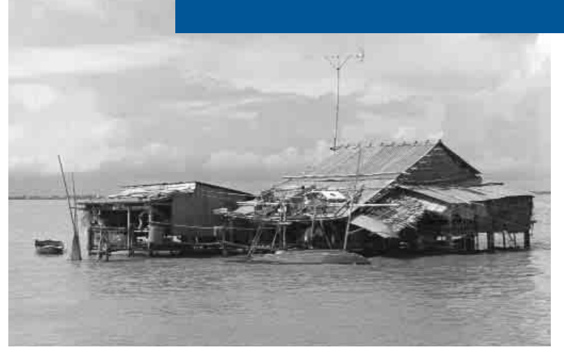
Vietnam Mekong Delta floods (November 2000).

The discussion so far has shown that peoples' livelihoods are dynamic, complex and variable in character, with the poor in particular responding with the means they have available to the vulnerabilities they face. The development of adaptation strategies to reduce the impacts of climate change on these people should reflect these dynamics of peoples' livelihoods, working in particular to reduce the vulnerabilities they face and to strengthen their resilience. This can only be achieved where adaptation is seen as a process that is itself adaptive and flexible to address the locally-specific and changing circumstances that are the reality of the lives of the poor.