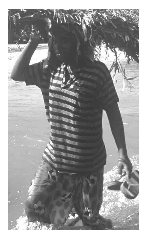
Mozambique floods (March 2001).

All of these six concepts—adaptation, vulnerability, resilience, security, poverty and livelihoods—are open to many interpretations. It is hoped that the explanations given here will provide a basis for the identification of the most effective processes through which actions to assist the poor and vulnerable to adapt to climate change can be developed.